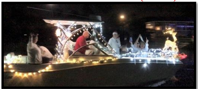
2nd Place: Santa Baby (Boat #7)