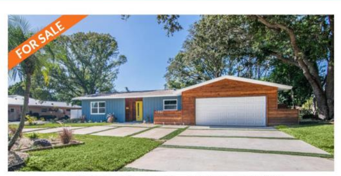
3897 38th Way S | 3 Bed | 3 Bath | 2,034 SF Offered at $488,888