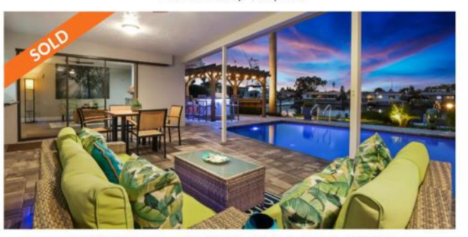
4401 37th Street S | 3 Bed | 2 Bath | 2,190 SF Last offered at $825,000