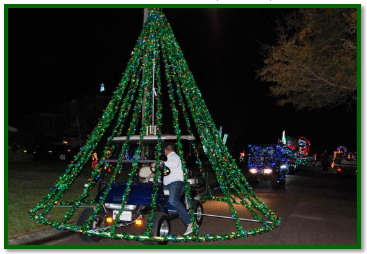
1st Place: Griswolds (Cart #6)