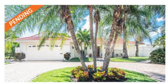
4401 44th Street S | 3 Bed | 2/1 Bath | 2,208 SF Offered at $775,000

Recognized as one of the "10 BEST" in customer satisfaction two years in a row! Debbie & her Team look forward to working with you!