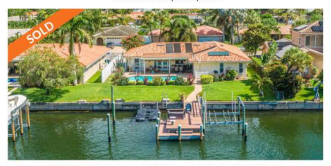
4230 48th Avenue S | 3 Bed | 2 Bath | 1,709 SF Last offered at $715,000